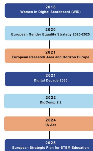
Figure 1 – Timeline of Key European Policy Instruments

against online violence and discrimination, and increased platform accountability (DSA).