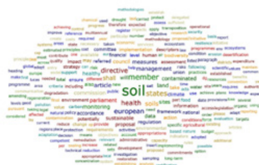
Figure 2. Word cloud considering the Soil Monitoring Law proposal (Martinho et al., 2024)

Carbon farming practices are fundamental to promoting soil carbon sequestration. Generally, pastures and grasslands, arable crops, horticulture and forest land use categories present the highest percentage of soil organic carbon (SOC). Between the soil groups with relevant levels of SOC appear the Leptosols and Umbrisols and among the most important indicators to predict the organic carbon are the nitrogen